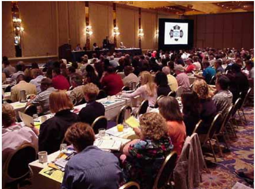
With 309 delegates, NSO once again records its largest ever Representative Assembly. The RA took place in New York City, NY, June 11-12, 2004.