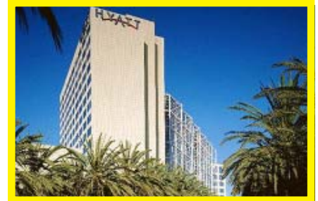
Hyatt Regency Orange County

This year's Retreat will give all attendees the opportunity to network, learn, experience and have fun doing it. See you in January!