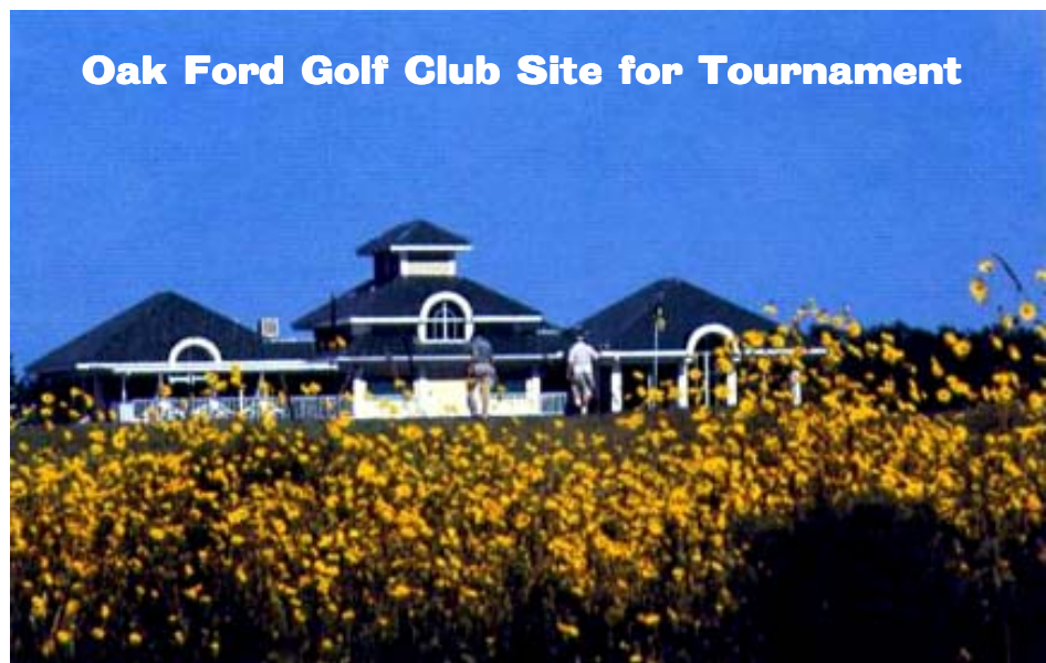
Sarasota's Oak Ford Golf Club will be the site for the 2005 NSO Golf Tournament.